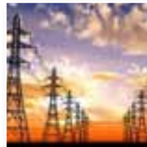
Utilities Power Generation